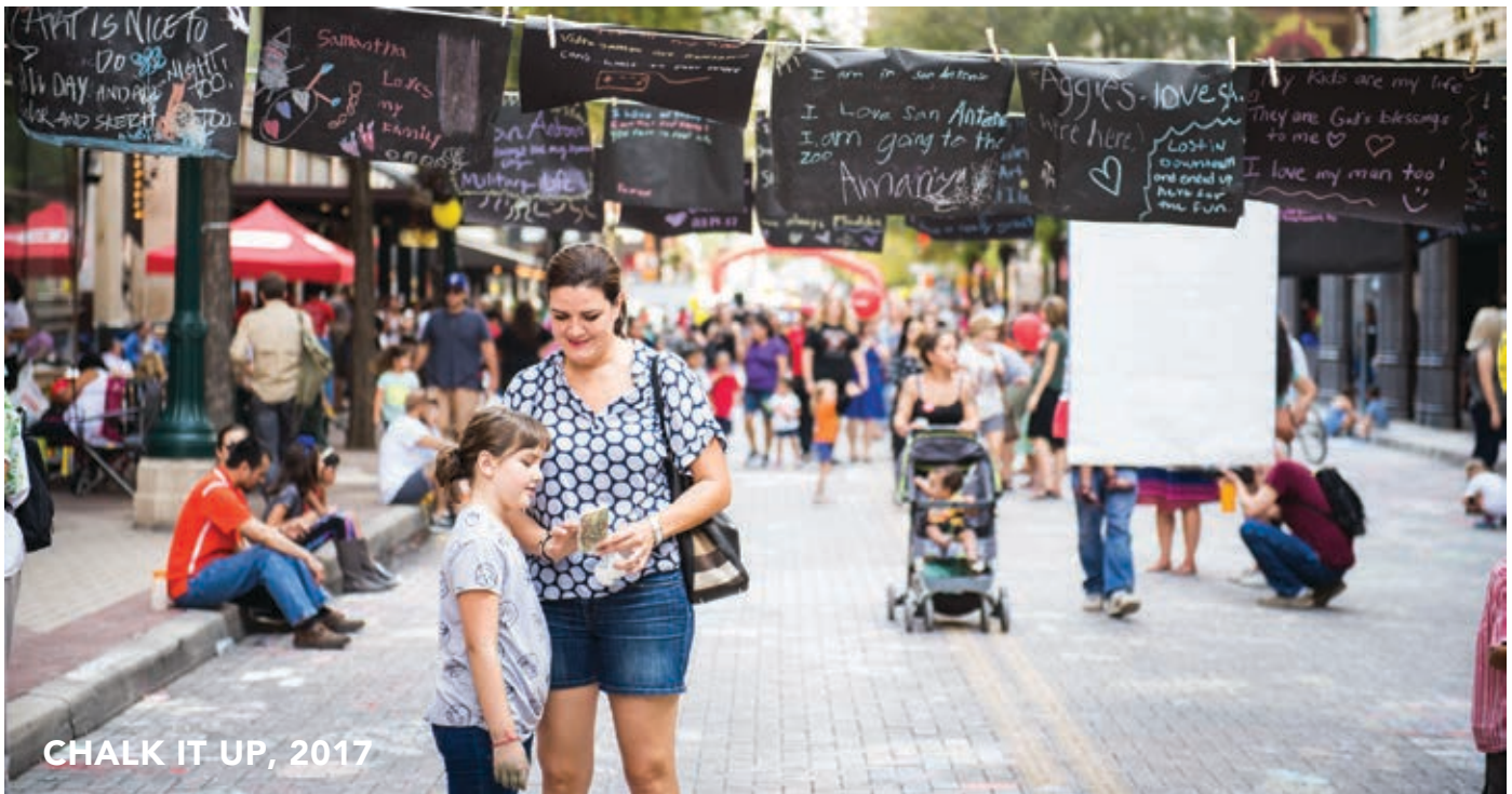
CHALK IT UP, 2017

In 2017, Chalk It Up was named “Best Downtown Event” at the 2017 Centropolitan Awards. This year’s Chalk It Up features an exciting new footprint which extends along the freshly redesigned Main Avenue. All support received for this free, family event will ensure the sustainability of Artpace’s public programs and the Artpace Teen Council. We hope you will join us as a sponsor during this once-a-year opportunity.